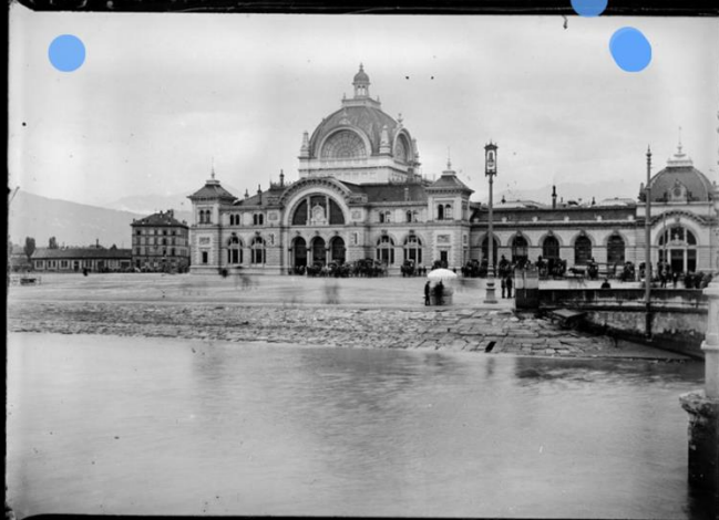
Der überschwemmte Bahnhofsplatz der Stadt Luzern