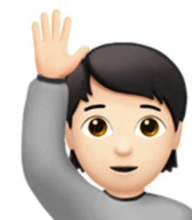
MLaw Innovation Manager