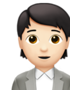
MLaw Data Protection