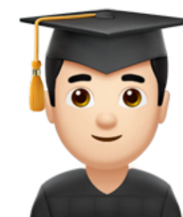
LLM/NLP PhD Candidate