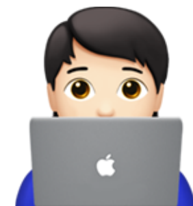
Senior Software Engineer LLM Expert